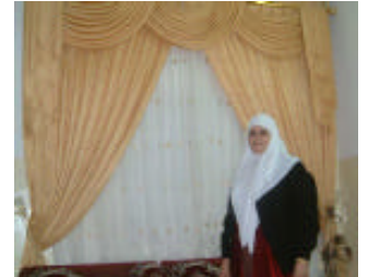
Her positive, innovative attitude for work makes a difference

Her reputation as a curtain-maker has spread by word-of-mouth and she thinks the keys to her business success are maintaining good quality of products, keeping strict deadlines and keeping prices down. But more than anything else, she likes her job and works hard. Her husband is also helpful.